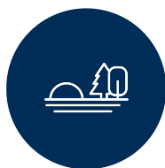
Country serenity and vibrant local life

Community life is lively, punctuated by festive events and outdoor activities such as hiking, cycling or even discovering the local heritage, creating a pleasant living environment and strengthening social ties.