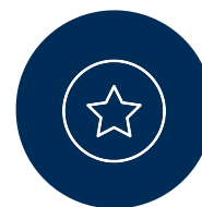
Exceptional residential project