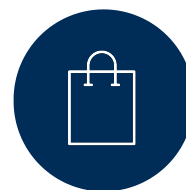
Close to all amenities