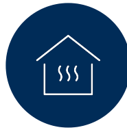
Ground-mounted - Heat pump