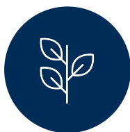
Quiet, green surroundings

This residence is a rare opportunity to live in a place that combines modern comfort, tranquility and nature, for a pleasant and sustainable living environment.