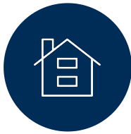
Located in a residential area

Budgets and technical specifications are available on request.