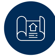
A modern, comfortable space