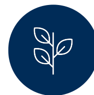
Quiet, green surroundings