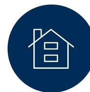
Palma is the capital of the Balearic Islands