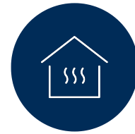
Underfloor heating and silent ventilation