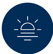
Located by the sea

Palma stands out for its cosmopolitan atmosphere, year-round dynamism and balance between ancient heritage and modern development. However, the city is facing challenges linked to tourism and real estate pressure, while at the same time seeking to preserve its historic identity.