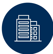
In the heart of the historic center