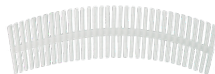
Curved - 2310021