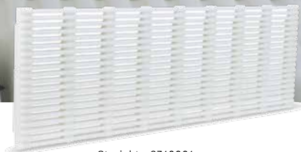
Straight - 2310001