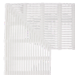
Corner - 2310041