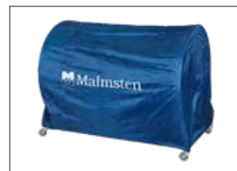
1050006 Cover for Trolley