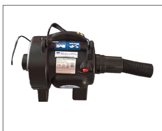
1515010 Electric Hand Pump