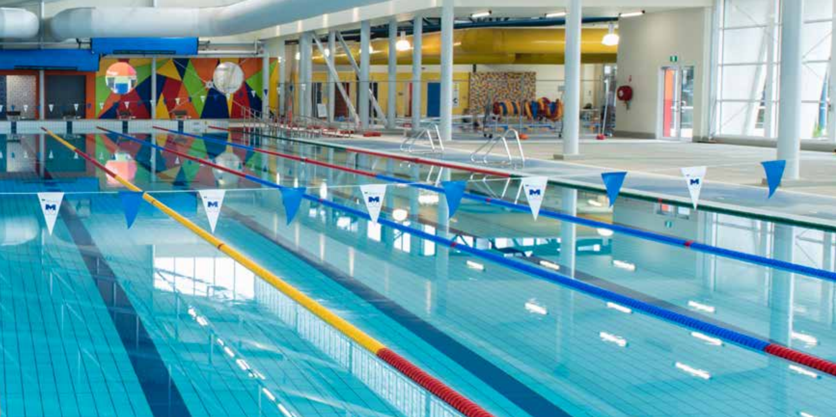
Ballarat Aquatic Centre, Australien, 2018

Järfälla. Malmsten supplied pool equipment, such as gratings, turnboards, starting blocks, lane lines, wall anchors, ladders, field of play and goals for water polo. The pool is equipped with a Malmsten Movable Floor with a bridge that can be separated into two. Malmsten is Official DURAFLEX distributor and certified installer.