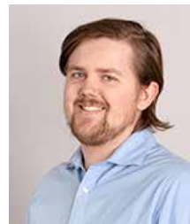
Vilhelm Svensson Warehouse