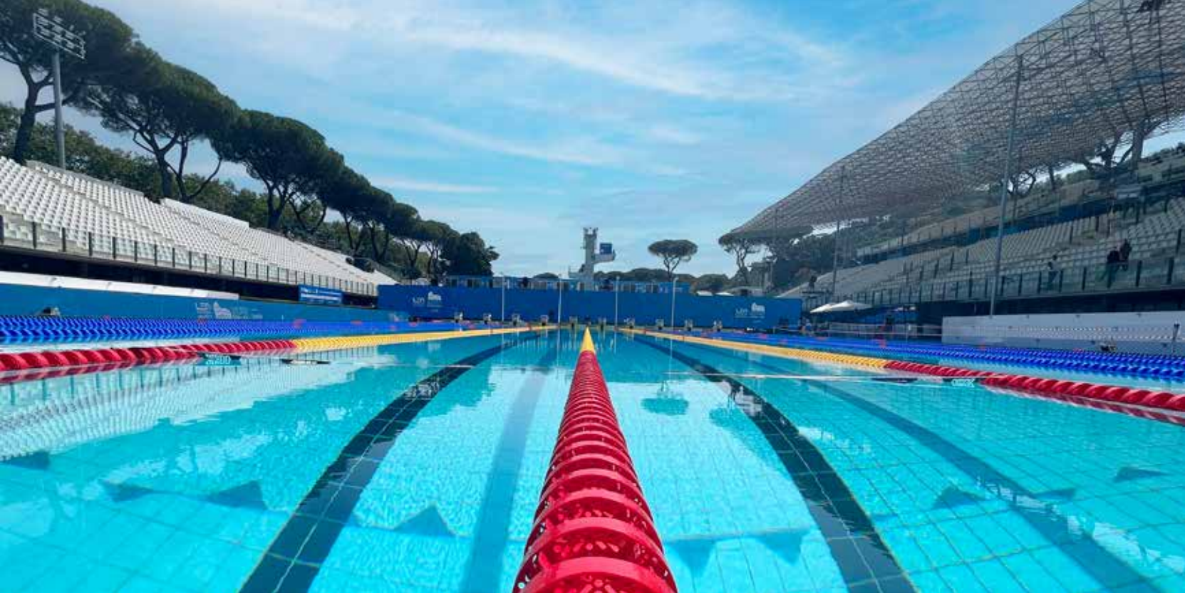
LEN European Championships (50 M) - Rome 2022