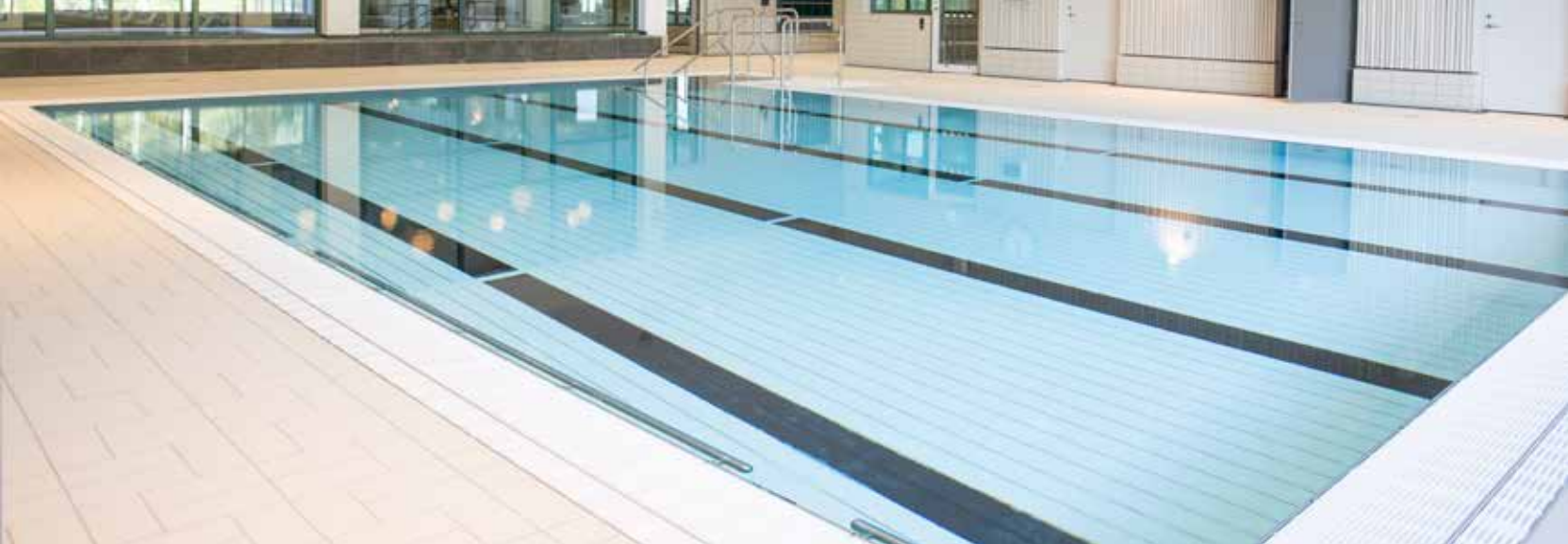
Kristianstad Badrike - Sweden - Malmsten Movable Floor Advanced model