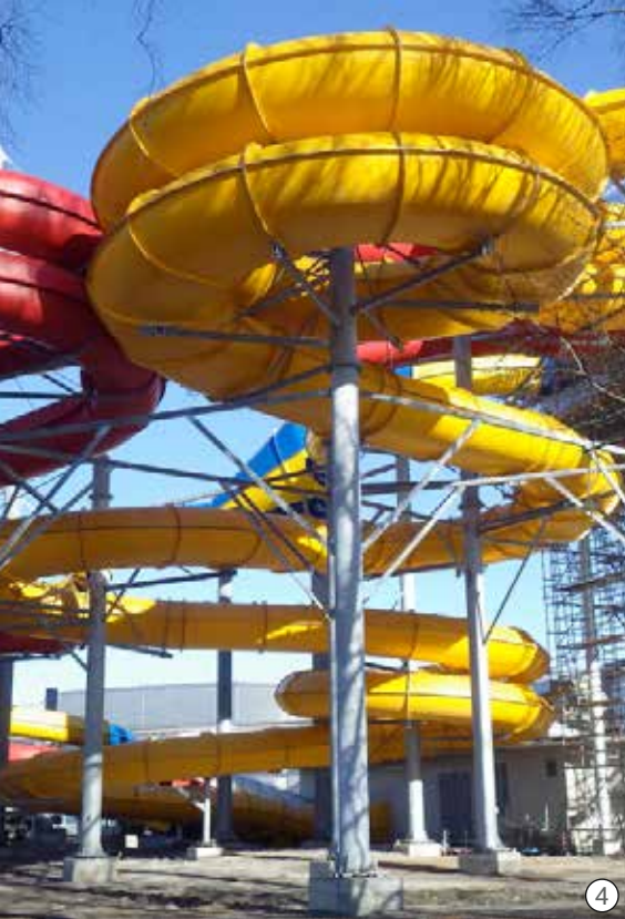
④ Gustavsviksbadet in Örebro, Water Slides supplied by HydroSport: four slides and starting platform.