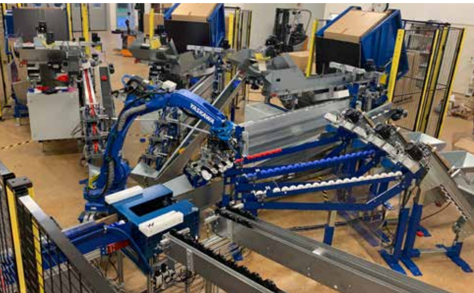
Linus, our robot, assembles lane lines