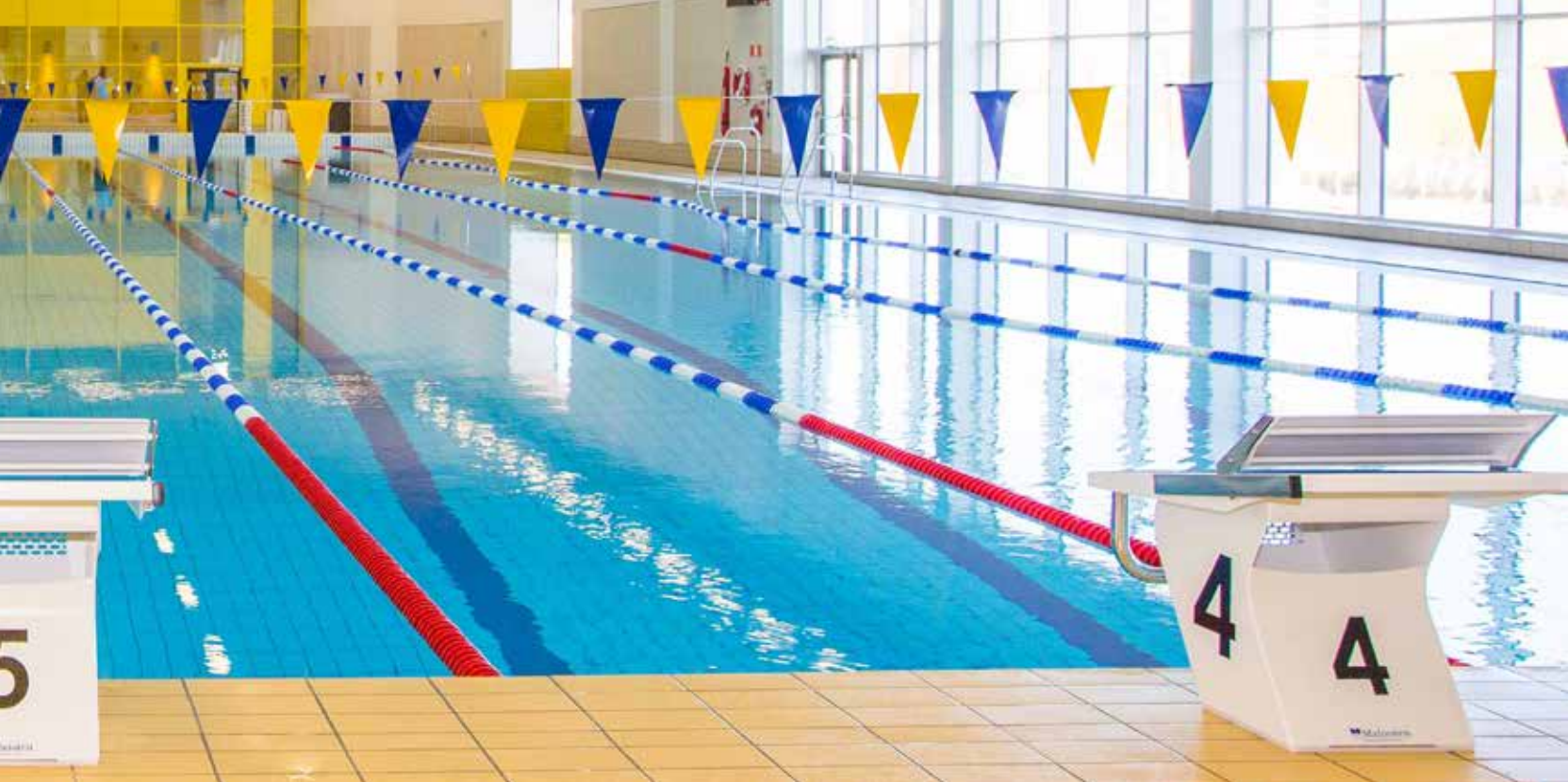
Hylliebadet in Malmö, completed in 2015. Pool equipment from Malmsten, including starting blocks, racing lane lines, movable floor with bridge, diving boards, changing rooms, etc.