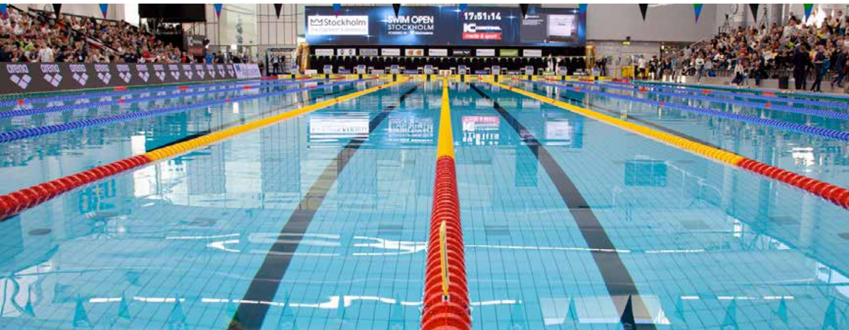
Swim Open Powered by Malmsten 2021 - Stockholm, Eriksdalsbadet