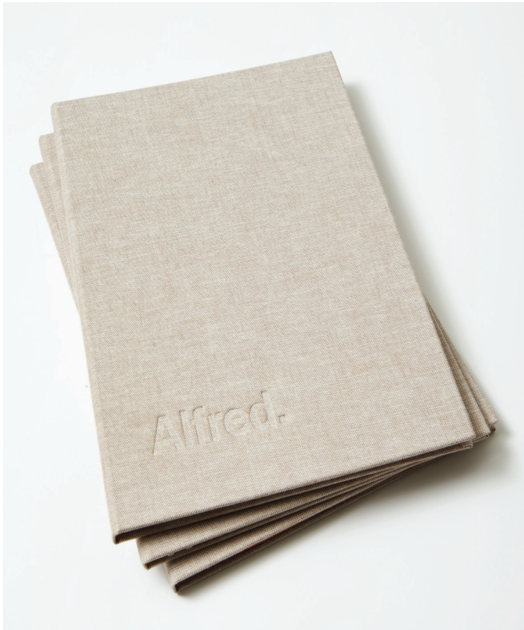
Meny omslag, skilleark og innmat