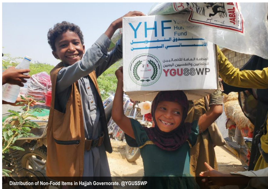
Distribution of Non-Food Items in Hajjah Governorate. @YGUSSWP